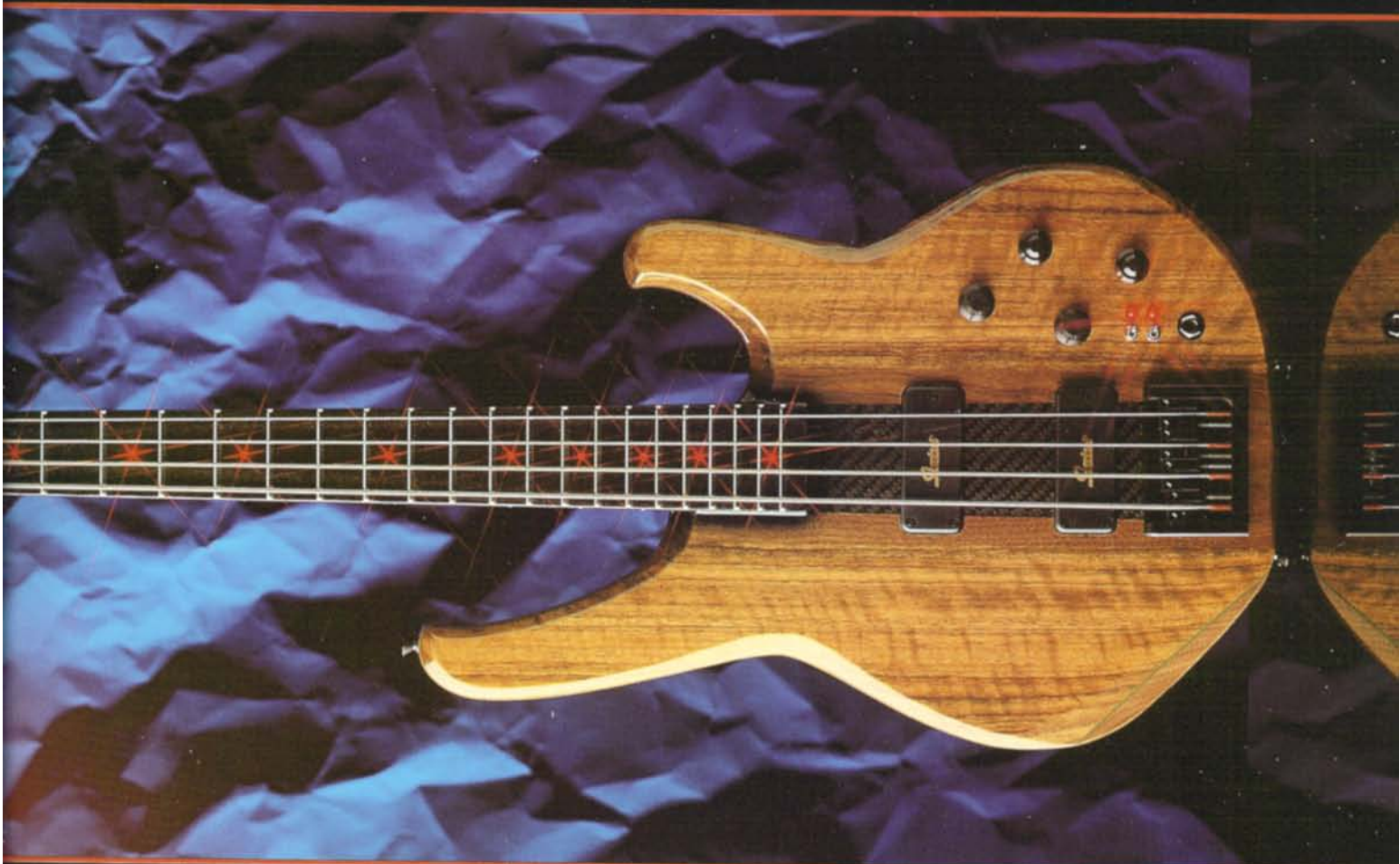
EMPATHY. (L.E.D.'s OPTIONAL).